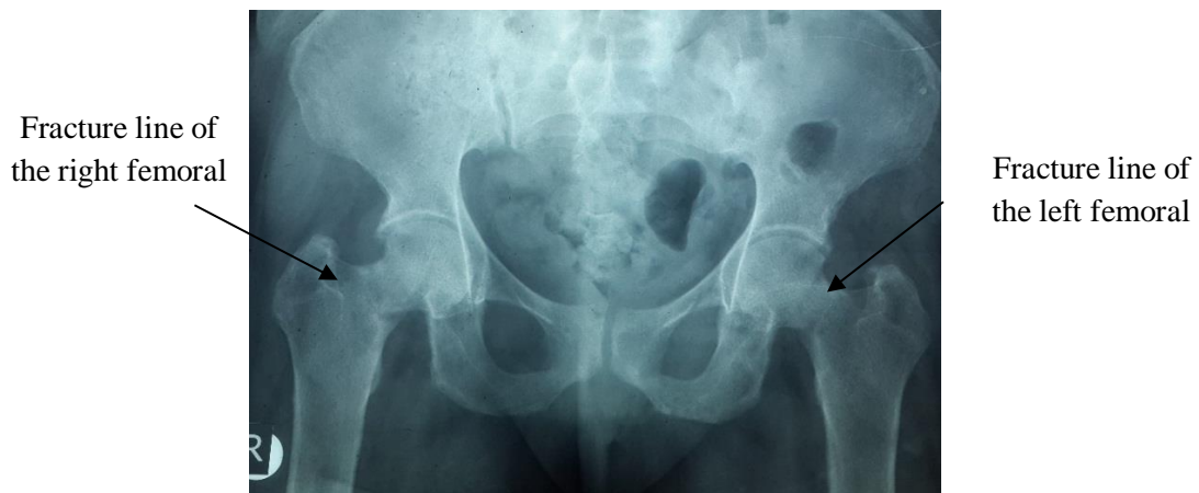
Figure 3: Standard radio image of a bilateral pathological fracture of femoral collar in a 57-year-old chronic hemodialysis patient.

Para clinically, the average PTH 1-84 was 913.85 \pm 331.65 \mu\text{g} / \text{ml} . The average calcemia was 90.75 \pm 7.67 \text{ mg/l} and the average phosphorus concentration was 44.74 \pm 18.39 \text{ mg/l} . The average of 25 OH vitamin D was 26.07 \pm 11.65 \text{ ng/ml} . The standard skeleton