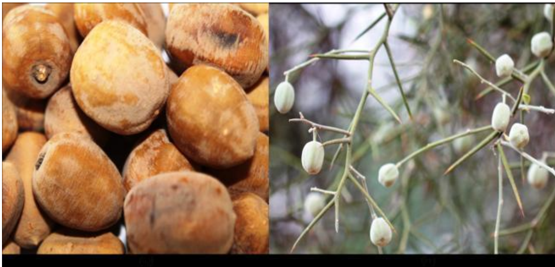
Figure 1. Immature (a) Photo M.B. Sagna (January 2011) and mature fruits (b) of Balanites aegyptiaca (L.) Del. This has been changed to brownish.