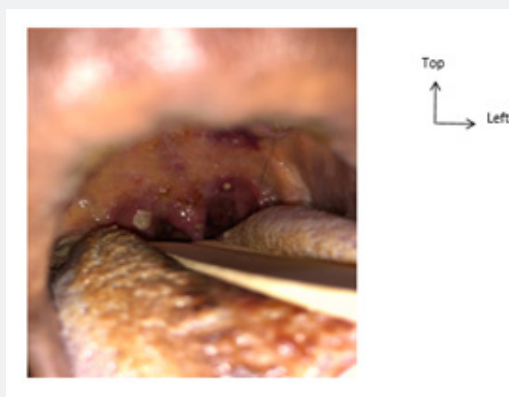
Figure 2: Enlarged palatal tonsils with whitish deposits, an edematous uvula and petechiae on the soft palate.

based on amoxicillin-clavulanic acid did not give a favorable result to his condition after 7 days of treatment. The retroviral serology was negative. A routine hemogram was requested. He showed bicytopenia with normochromic normocytic anemia (Hb=8g/dl), hyperleukocytosis at 120,000/mm 3 and thrombocytopenia at 78,000/mm 3 with blood blastosis at 87% thus suggesting acute leukemia. The patient was immediately transferred to the clinical hematology service of the national blood transfusion center in Dakar. The realization of the myelogram showed a proliferation of monocytoïd blast-like cells at 55% showing an acute myeloid leukemia type 5 of the FAB classification. The patient unfortunately died before treatment (Figure 2).