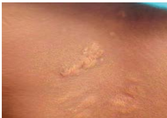
Figure 3: “Shagreen patch” (picture taken in the service).