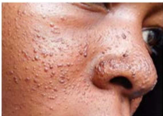
Figure 1: Facial angiofibromas (picture taken in the service).