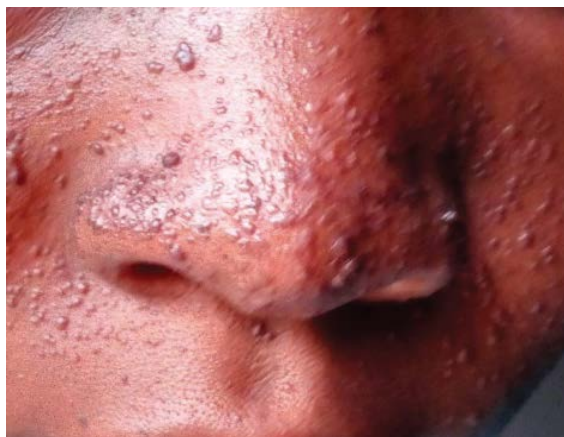
Figure 2: Facial angiofibromas, symmetrically (picture taken in the service).

The final diagnosis of the tuberous sclerosis or Bourneville's disease is deduced from the association of two (2) major criteria or a major and two minor criteria as described on (Table 1) [10]. Our patient had three major criteria which have confirmed the tuberous sclerosis diagnosis. We have proposed the Sirolimus for the causal treatment as recommended by the medical reviews [11-14]. We have also recommended a half yearly follow-up in the Nephrology department. The Consensus Conference recommends a yearly medical follow-up [15].